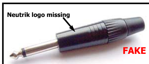
Right - This is a C Style look-alike

ClearTone™ only use the read deal plugs!