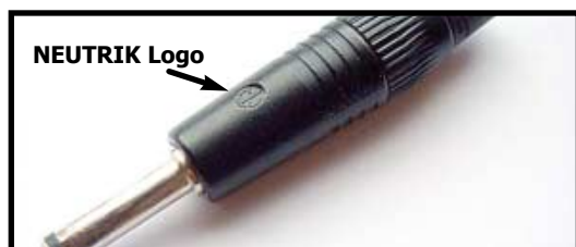
Left - This is a real C Style NEUTRIK Jack Plug

Well if only that was true! Because whilst the outside of the copy jack plugs look like the real thing, the inside most definitely does not.